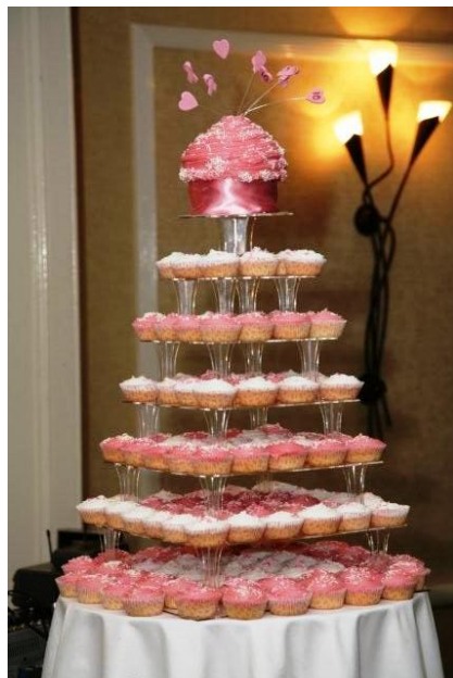
Breast Friends 10 Year Birthday Giant Cup-Cake