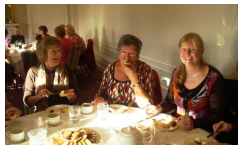
Yum, Yum!! Breast Friends Members Enjoy A Cream Tea