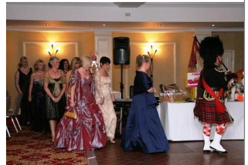
The Piper leads the Committee