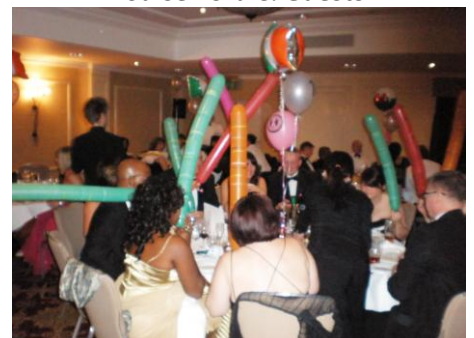
Balloons to Attention!