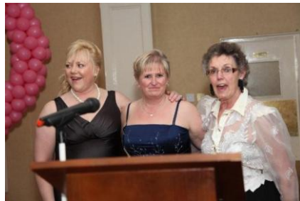
Our Lady Speakers