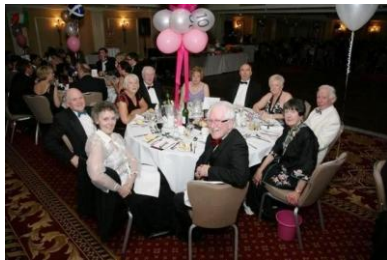
The VIP Table