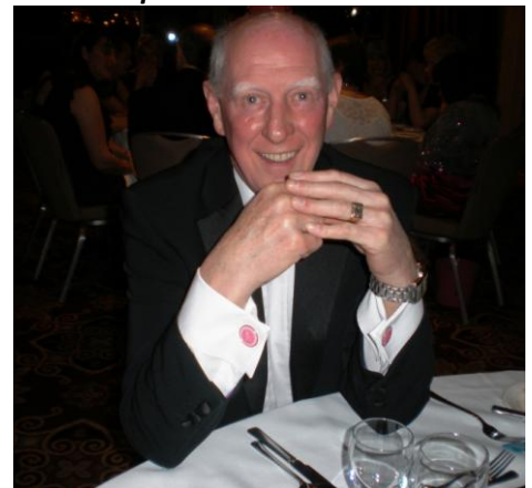
Alan's Breast Friends Cufflinks