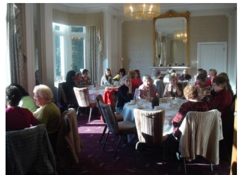
Our ladies enjoying a sunny afternoon at Hampton Manor